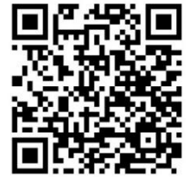
SoupSupper Sign Up