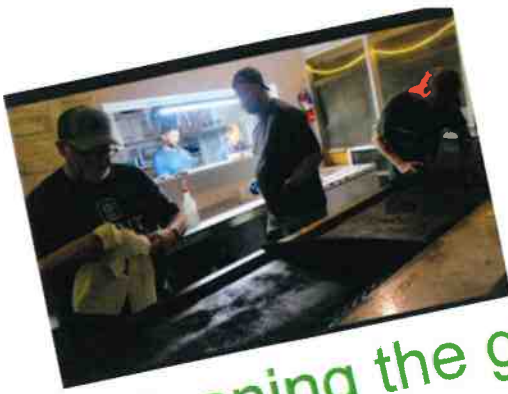
Cleaning the grill!