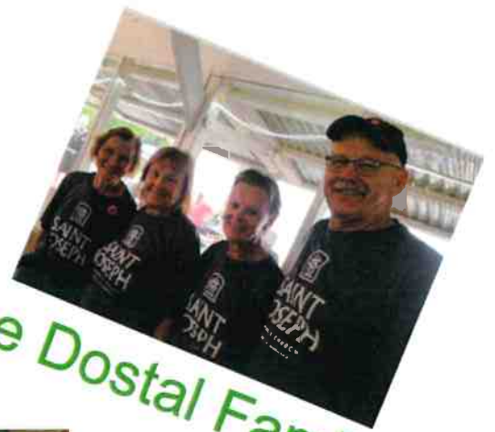
The Dostal Family