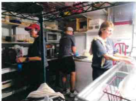
So many dishes!