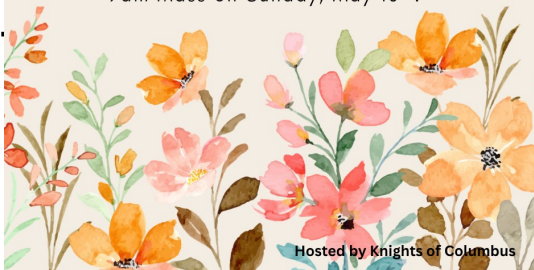
Hosted by Knights of Columbus

Join us for brunch in the parish hall after the 9am Mass on Sunday, May 10 th .